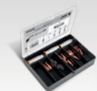
MB25 torch consumables kit 041233

Ball and socket joints on both ends of torch.